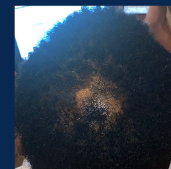
After 2 Months