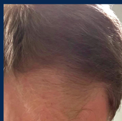
After 3 Months