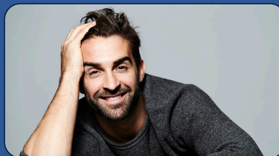
Formula H5® for Men