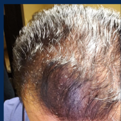
After 4 Months