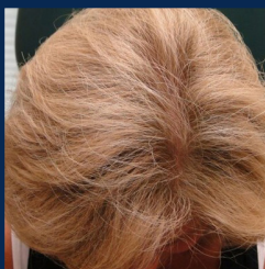
After 2 Months