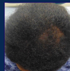
After 4 Months